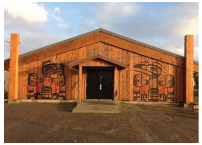
Youth Center in Old Masset, Haida Gwaii

The Haida community session was held in Old Masset, Haida Gwaii. Haida youth indicated that they were not often included in research. In fact, many youth spoke of just one research paper that they are aware of, that speaks to the experiences of Haida youth. This echoes their concerns of being left out of important conversations relating to them. Compounding this, the research that is being conducted with Haida is often only inclusive of the "regulars," or those community members who have strong voices and elevated positions of power